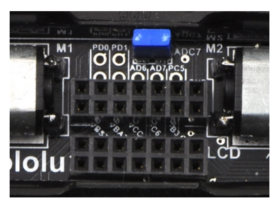
A 2×7 female header soldered into the 3pi expansion pin holes.

Begin by soldering the 2×7 female header where it fits between the 3pi's gearmotors, as shown in the picture below. If you do not have the header, you can still build an RC 3pi; you will need to solder the wires directly to the 3pi's circuit board in the places where they would have been inserted into the female header.