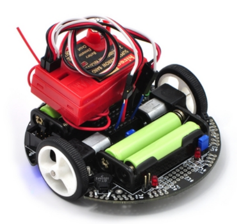
A radio-controlled 3pi.