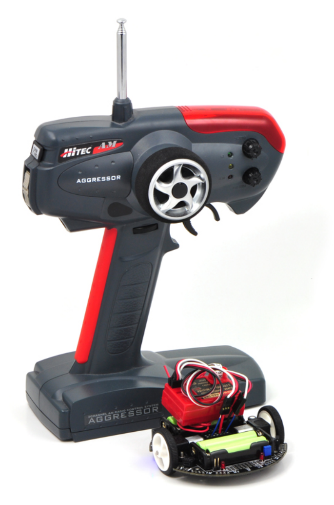
A radio-controlled 3pi with an RC transmitter.

The 3pi robot [http://www.pololu.com/catalog/product/975] is complete mobile platform designed to excel in line-following and maze-solving competitions. The 3pi has user accessible I/O lines that can be connected to different sensors to expand its behavior beyond line-following and maze-solving. This project shows one possible configuration where a two-channel radio-control (RC) receiver connected to the 3pi enables manual operation of the platform with minimal soldering. Many other sensors could be used to expand the 3pi, including distance sensors to make a wall-following robot. [http://www.pololu.com/docs/0J26]