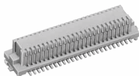
Figure 2-1 50 pin board to board connector

ADH8066 connector is a 50 Pin board to board connector with 0.5mm pitch as figure 2-1. The model number is Hirose's DF12C(3.0)-50DS-0.5V.