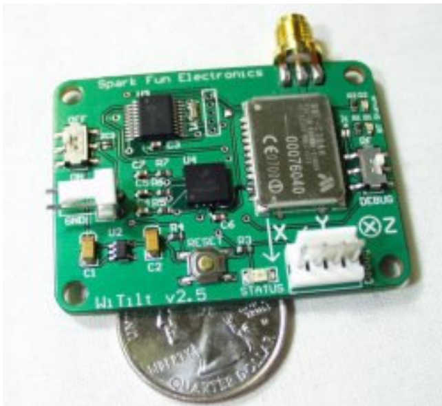
WiTilt v2.5 2.4GHz Wireless 3-axis Tilt Sensor 3/2/2006